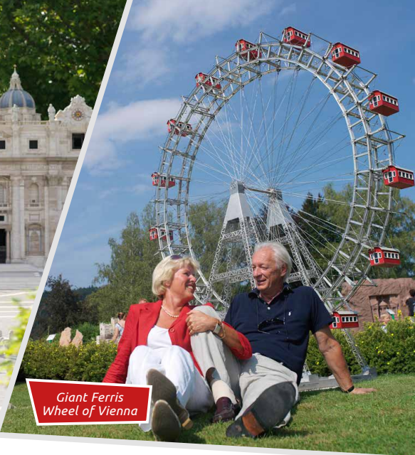
Giant Ferris Wheel of Vienna