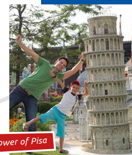
Leaning Tower of Pisa