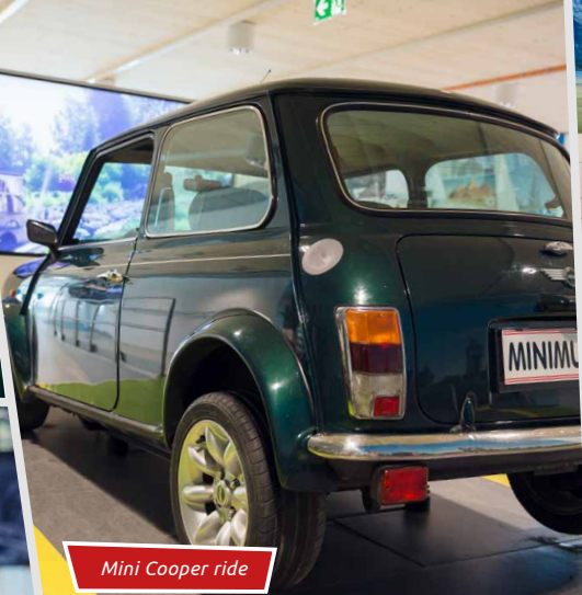
Mini Cooper ride