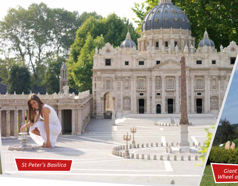
St Peter's Basilica